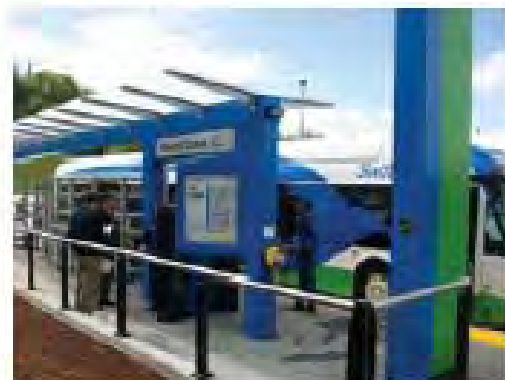
Swift BRT Everett (WA)