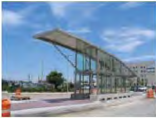
Cleveland Euclid Corridor (OH)