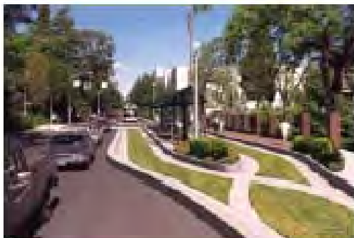
Eugene Emerald Express (OR)