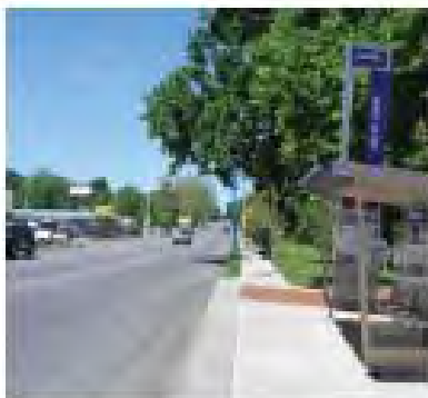
Kansas City Max BRT (MO)