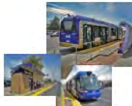
Las Vegas Max (NV)