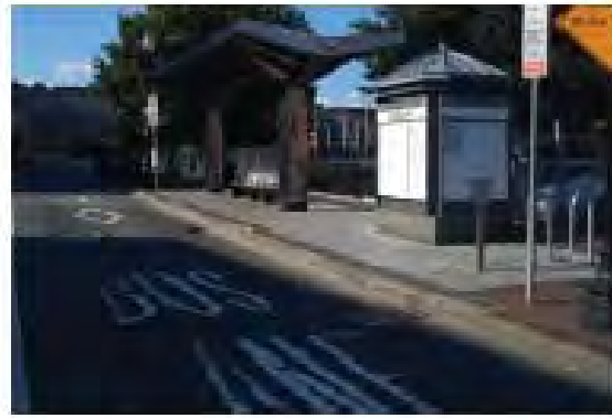
Boston Silver Line (MA)